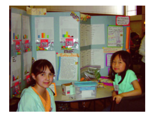
Two participants at FAME 2006

There are three levels: elementary (grades K to 5), middle (grades 6 to 8) and senior (grades 9 to 12). The winning elementary school had students from grades 2 and 3. Entries are judged and prizes are awarded for the best exhibits.