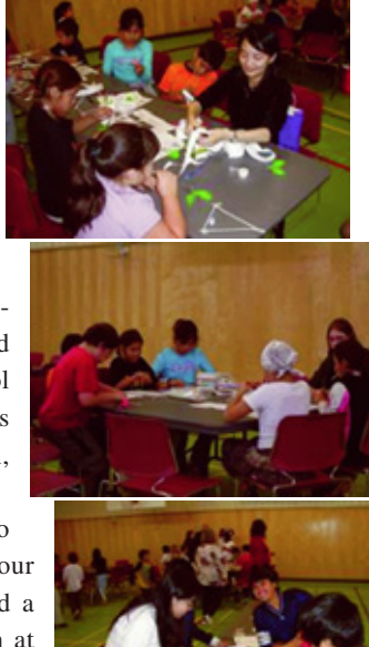
Students tackle math problems at Math Mania events in Lytton and Sk'elep

dren. The visit ended with the school's Math Evening, where students and their families tackled round-robin math activities in a fun and exciting way.